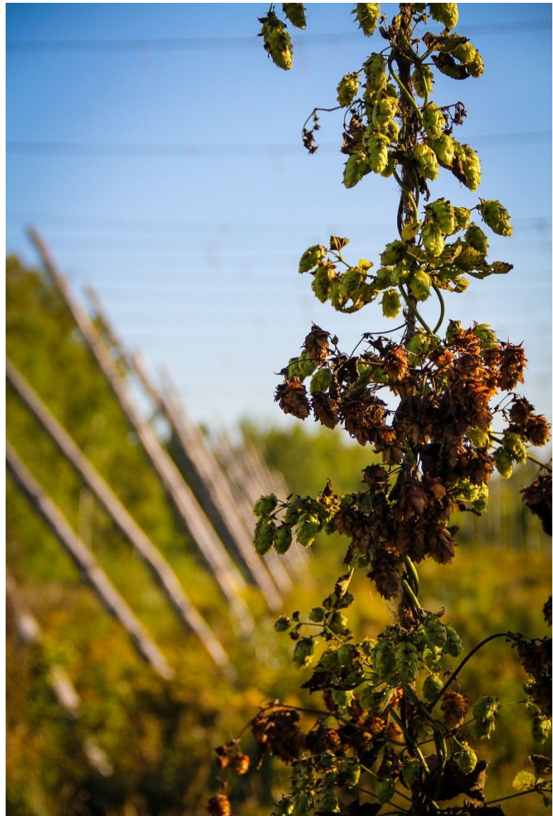
Aroostook Hops, Westfield, ME

We take a holistic view of economic revitalization. We listen to individuals and businesses to inform our products, programs and advocacy to enable all people and communities to thrive.